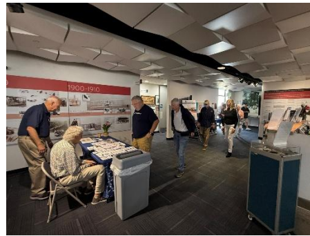
Members arrive to the check in desk