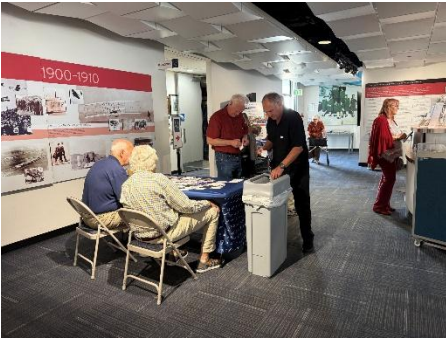
Stragglers at the check in table