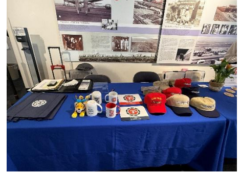
The raffle table, where members place their tickets to win a price, and merchandise tables with coffee mugs, mouse bags, shopping totes and more are all set up for members upon entrance.