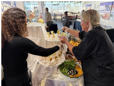
Caterer putting finishing touches on the appetizer table