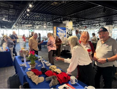
Members checking out merchandise options