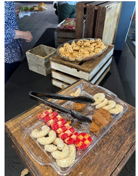
Lunch consisted of roast beef, leak mashed potatoes, rice pilaf, vegetables, salad and an array of homemade desserts.